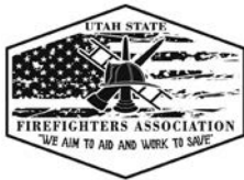
Utah State Firefighters Association