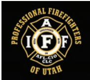
Professional Firefighters of Utah