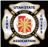
Utah State Fire Chiefs Association